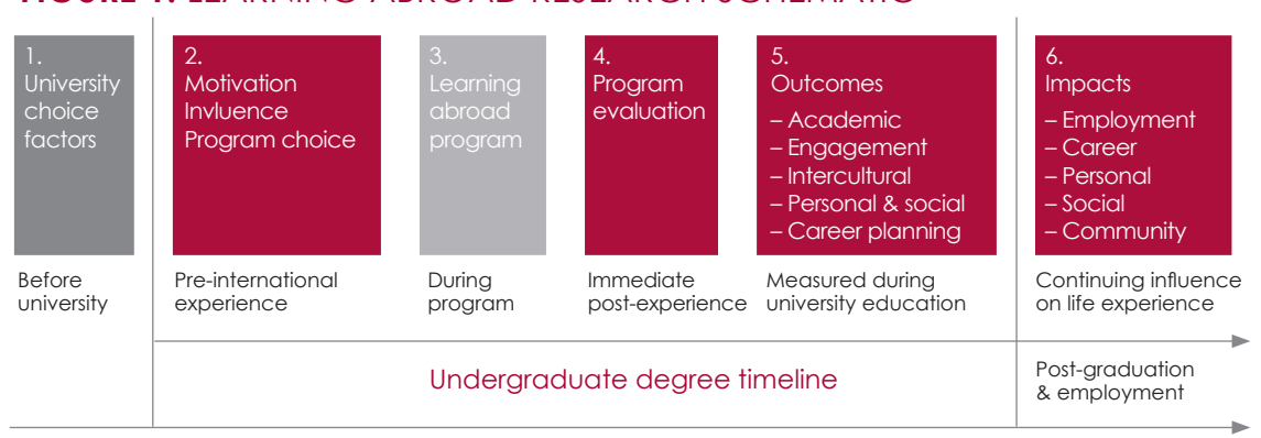
Influence of individual characteristics, other co/extra-curricular activities

Firstly, as previously discussed, learning abroad opportunities are becoming increasingly prominent to prospective student audiences in university recruitment and profiling activities. The availability of learning abroad programs can influence university and program choice, indicating the importance students now place on international learning opportunities as part of their overall higher education experience.